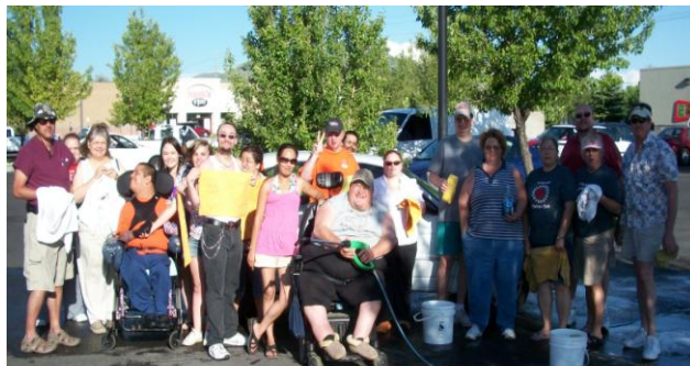
THE FRIENDS CIVITAN CLUB at their car wash fund raiser and Camp Taylor Campout at Scout Mountain

The Friends Club has been busy this summer. They raised $1000 for the Relay team & showed up for Open Ceremonies. They have a wonderful time at Camp Taylor—tied dyed shirts, played Bingo, did Karaoke each night, had a big Bonfire each night with smores. They had 28 campers and 20+ volunteers from the Bannock Civitan Club. In August, the Friends club attended their first District Meeting in Pocatello. They really enjoyed meeting other Civitans from the District.